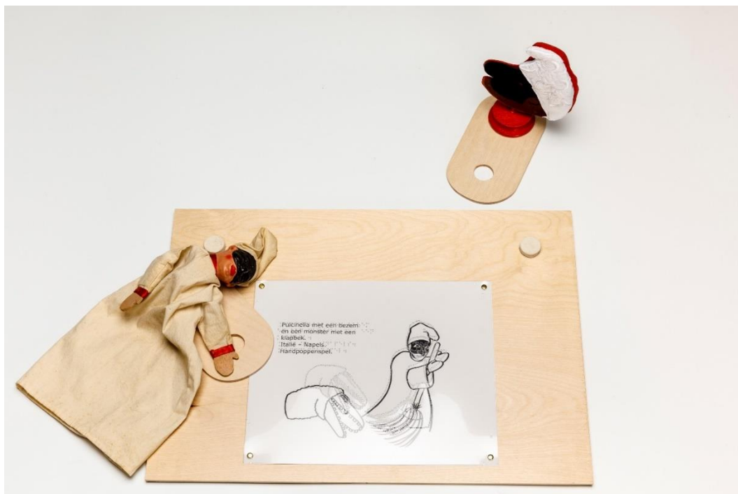
Displays exhibition 'A look behind the scenes of puppet theatre': Egg trail with two eggs – Half mask and clamp: transparent with combined script – Mask of Pulcinella. Pulcinella: glove puppet – Pulcinella and monster: tactile picture, transparent with combined script – Pulcinella: table top puppet. Illustration: Elsje Zwart – Concept: Otto van der Mieden.